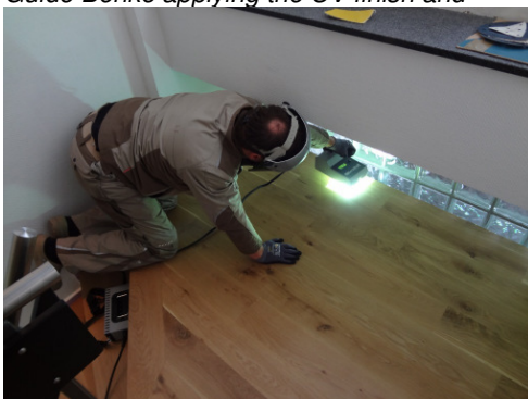
... curing the finish with UV light.