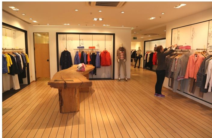
Bogner Haus, Munich: UV-finished and -cured maple with rubber joints. For more information: www.uv.loba.de/en

Be it restaurant, hotel or retail shop: renovating wood floors in a business that takes in thousands of euros a day usually means closure times and income loss. The technological process developed by LOBA in cooperation with the Institut für Holztechnologie Dresden minimises these losses by drastically reducing the time