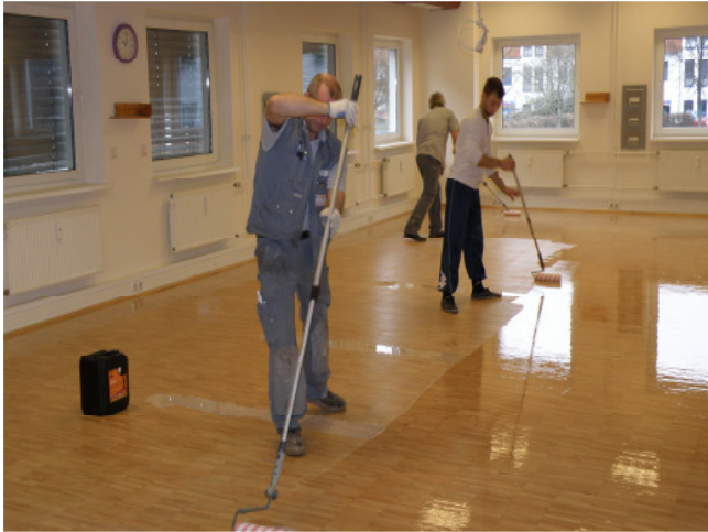
Applying the UV finish LOBACURE WS Rush A.T. For more information: www.uv.loba.de/en

With the new UV finish, LOBA is also fulfilling its responsibility for the safety of flooring professionals and users. In October 2013 the UV finish WS Rush A.T. became the first varnish to earn the Emicode® EC1R PLUS quality seal. Its emissions values are far below the previous limits of the EC1 seal.