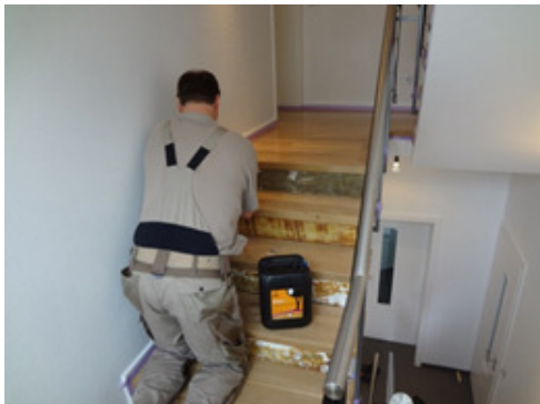
Guido Benke applying the UV finish and

The UV hand light was further developed in cooperation with UV-light manufacturer DecoRad® and presented in September 2013. Thanks to the new handling, it is now possible to work in an ergonomic and back-friendly standing position.